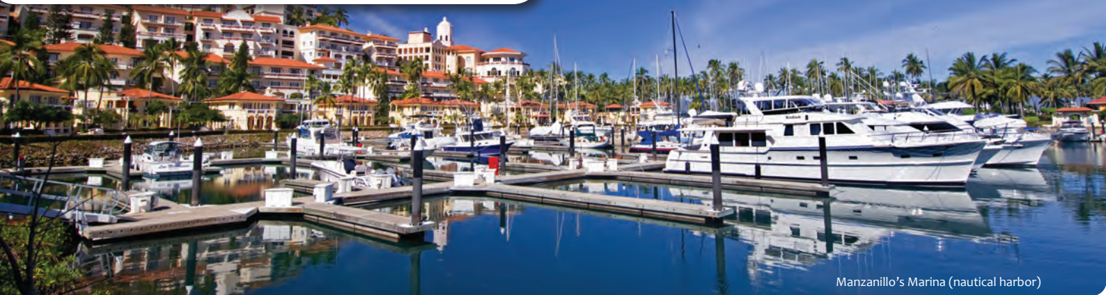
Manzanillo's Marina (nautical harbor)

Beautiful port who's growth has benefited the travel industry with the construction of important hotel complexes, as well as top level golf courses.