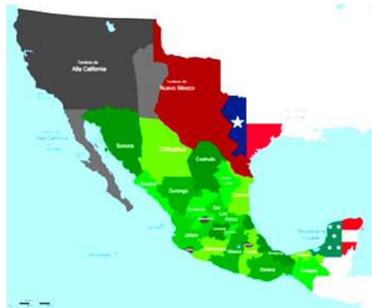
Mexico in 1845, showing the territories of California, Santa Fe, Nuevo Mexico and the independent Republic of Texas

The Americans, however, rapidly adapted to the unfamiliar conditions and eventually prevailed. In the end, Ampudia's forces were cornered in the Zocalo of the city where American Howitzers threatened to