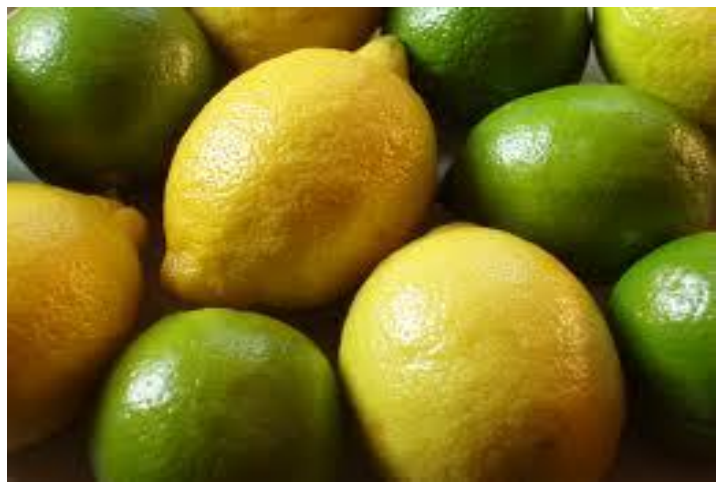
Lemons and limes

I have always been a lemon lover. However, in spite of this wonderful fruit being a major export of Mexico we have had difficulty finding them when shopping. Instead we have found mountains of limes. Lime juice is another of those staples that shows up at the tables of restaurants and homes in Mexico and we have become certifiably addicted to them ourselves. Lime juice forms the basis of many dishes again like salsas and it is simply delicious squeezed over fish dishes and steaming vegetables. And of course you can find this staple in Margaritas, topping a cool beer or popped in your mouth after a shot of tequila!! (....er so I'm told....)