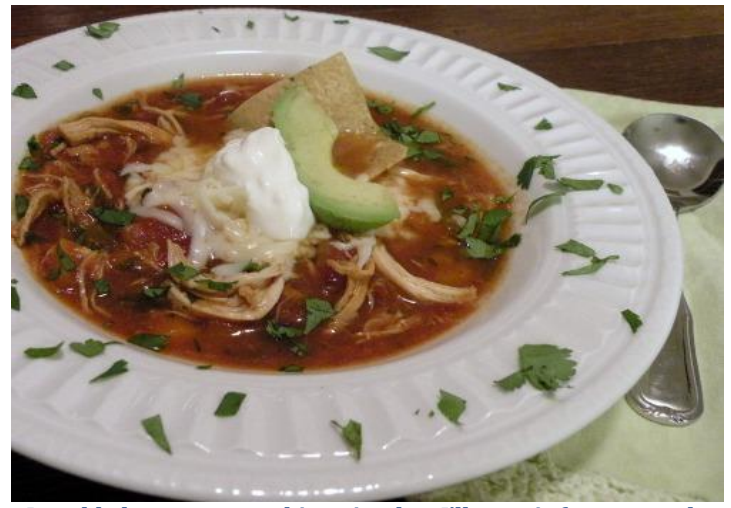
I could share more at this point, but I'll save it for some other time. I'm off to the kitchen. Happy cooking in Manzanillo.

We've even wondered about sneaking some cans home in our suitcases but of course weight is an issue. But while you are there in Manzanillo enjoy this: heat the Tortilla soup according to instructions; we add peeled shrimp or chicken chunks for a meal in a bowl. Throw in a handful or two of tortilla strips (commonly found in the bakery sections). Then when ladling the soup into soup bowls and while it is still hot, sprinkle on any kind of grated cheese (we like the white cheeses), throw on a dollop of sour cream and top with a few chunks of ripe avocado and serve. We have prepared this for friends and received rave reviews. By the time you sit down and put your spoon in the bowl, the cheese has softened and stretches onto your spoon! Enjoy!