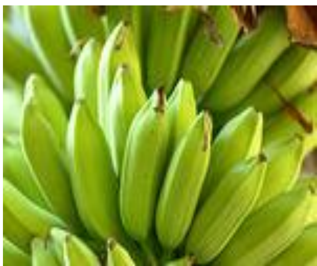
Tiny bananas (platanitos as the locals call them)

Have you found yourself only wanting half a banana instead of a whole one? Then the other half banana lies around for tomorrow. Our house keeper in Manzanillo is also our daily Spanish tutor on all things about the house. She calls the tiny bananas we buy 'platanitos' which I think means tiny banana (platano). These clusters of tiny bananas which are about a third the size of one regular banana are really wonderful. They are a little sweeter and slightly more flavorful than the large bananas and we are constantly snacking on them, slicing one onto cereal or into our yogurt or ice-cream. If you like bananas you'll love these little guys.