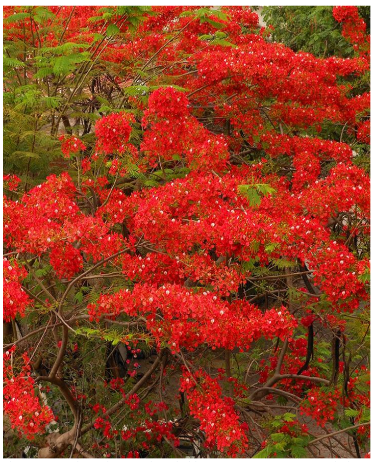
There is something almost indescribable, protecting, yet massive, dark and yet vibrant... and, of course, flamboyant. Nothing in the tropical landscape is more beautiful." Robert Lee Riffle

This spectacular, tropical, shade tree has a smooth, gray colored bark. Its feathery, fern-like leaves are evergreen if watered year around but will drop off if the tree