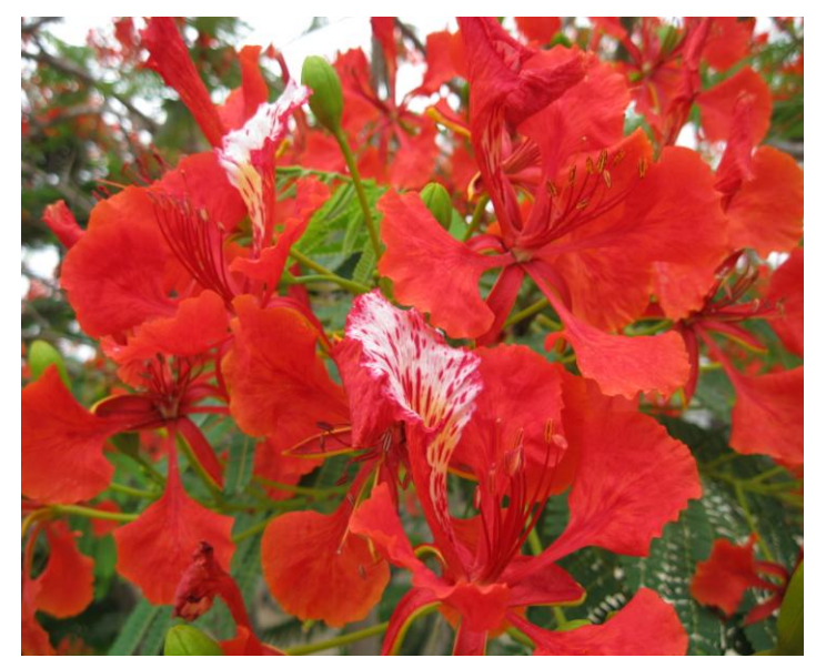
Well named, the riot of brilliant red flowers of the Flame Tree are a delight to see

The compound, doubly pinnate leaves have a feathery appearance and are a characteristic light, bright green. Each leaf is 30-50 cm long and has 20 to 40 pairs of primary leaflets or pinnae on it, with each of these further divided into 10-20 pairs of secondary leaflets or pinnules. A malleable sort, this tree can tolerate aggressive pruning and be kept rather small.