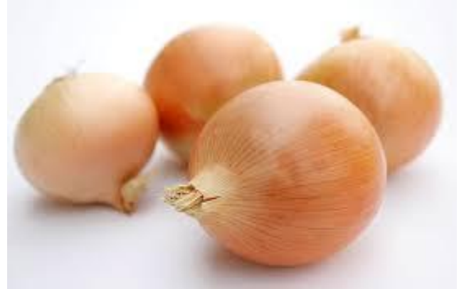
sweet Vidalia onions

Now some would say an onion is an onion, and so would I. But I have discovered that the white onions in Manzanillo are incredibly mild, sweet and tasty. As a matter of fact you can chop them easily without the usual eruption of tears. Onions for me tend to be harsh on the digestive tract but not these yummy babies; I add them to almost everything: stews, soups, stir fries, oven roasts and salads. And I can happily tell you that I have not experienced the otherwise typical roster of symptoms.