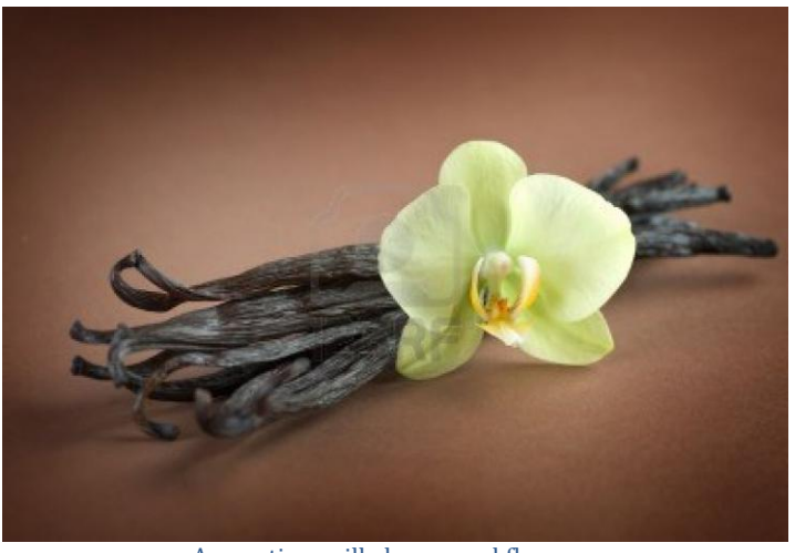
Aromatic vanilla beans and flower

I thought I knew what vanilla was until I tried the real vanilla produced in Mexico. That quite expensive artificial stuff they provide back in Canada is simply that - artificial. We are spoiled rotten now by the amazingly rich flavor of the real vanilla. We have found a brand we like called 'Orlando' but I also tried a small unknown name from Wal-Mart and it turned out to be just as good.