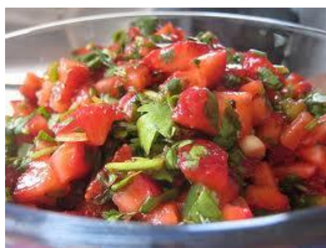
fresh salsa with cilantro

In Canada, we rely a great deal on importation of many foods, so in the case of spices for example, I have not been a big fan of cilantro. This is because I always used the dried spices version of this spice especially during