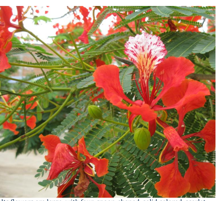
Its flowers are large, with four, spoon-shaped, solid colored, scarletred or orange-red petals and a fifth upright petal called the standard. which is slightly larger and is spotted with yellow and/or white.